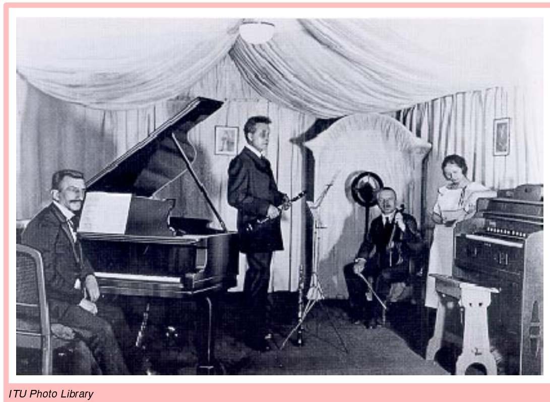
Figure 1 Studio for the weekly Sunday Concerts established by the Deutsche Reichpost in the radio station Königswusterhausen in 1923.

As more and more ships became equipped with radio, problems soon arose. The lack of any kind of international regulation meant that every operator could do more or less as he pleased. Interference became an acute problem and the efficiency of communications was greatly reduced. This situation led to a first preliminary Radio Conference being called for 1903 in Berlin, only six years after Marconi created his Wireless Telegraph and Signal Company on 20 July 1897. It was attended by nine countries and led to the holding, in 1906, of the First International Radiotelegraph Conference at which a Radio Convention was drawn up, closely modelled on the Convention of the International Telegraph Union (St Petersburg, 1875). In addition, the Conference drew up the Service Regulations for radio which were annexed to the Convention, again following the model of the Telegraph Convention and its annexed Telegraph Regulations.