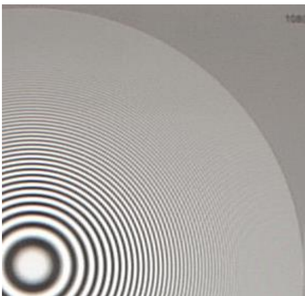
Figure 3 Resolution 1080i, detail+20 H/V-15 spatial aliasing has risen as well. It was not found