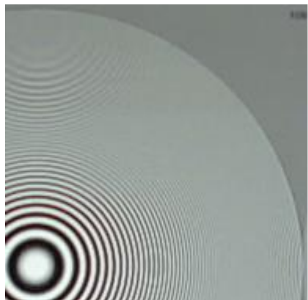
Figure 2 Resolution 720p, detail +20 H/V-15