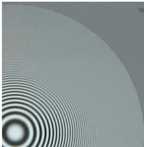
Figure 1 Resolution, 1080i

The aliasing is coloured, which is normal for single sensor, Bayer-patterned, cameras with 1920x1080 sensor. Clean resolution should reach 960x540 (the lower left quadrant of the pattern since that is the resolution of the red and blue Bayer pattern. Resolution up to 1920 and 1080 should be mutually exclusive, i.e. no increase in diagonal resolution beyond 960x540. The diagonal aliases are at low level, which confirms that the lens is the main limiting factor.