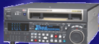
HDW 2000/J-H3 HDCAM