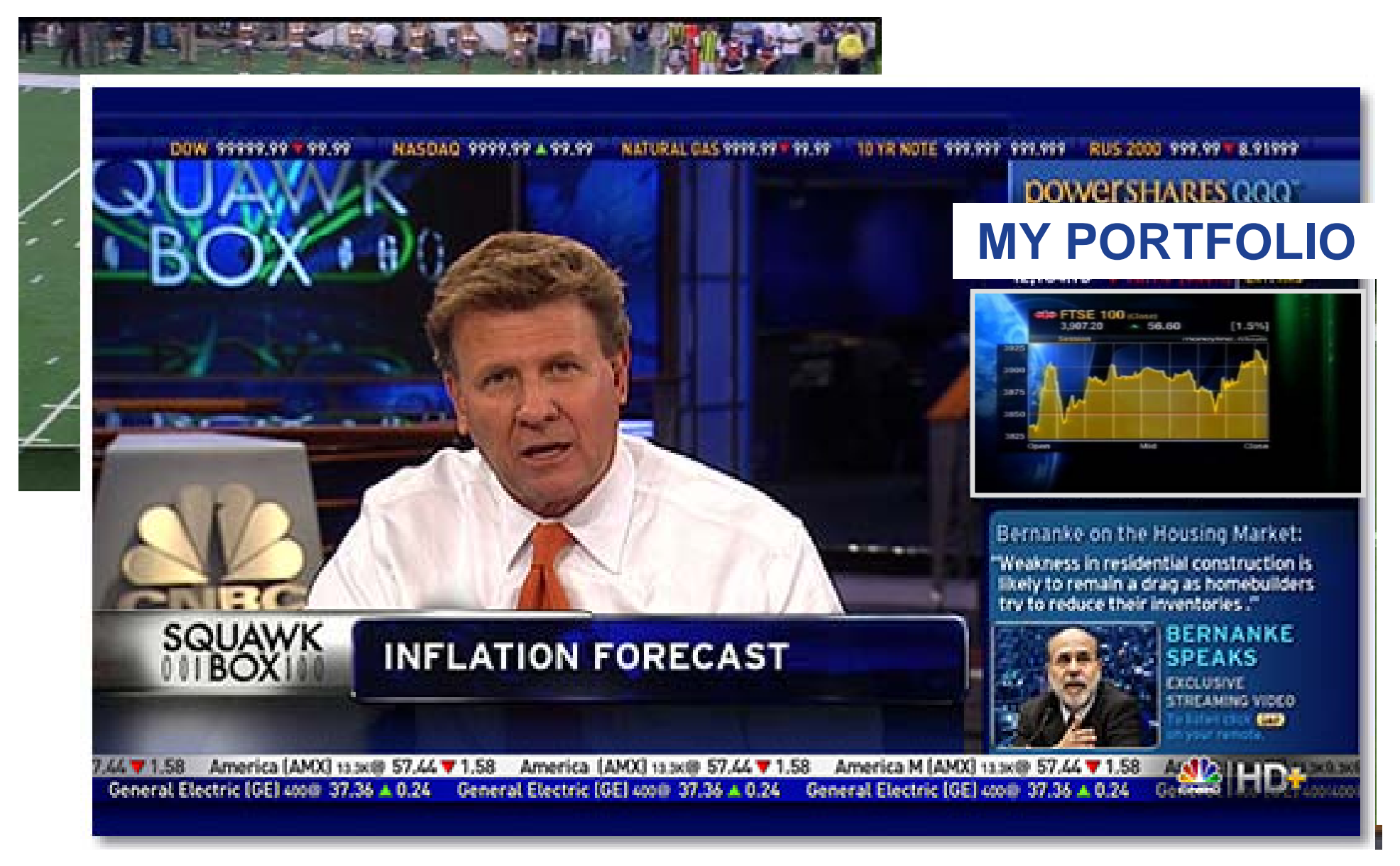
TV needs knowledge of Program, Time Sync, Space Sync