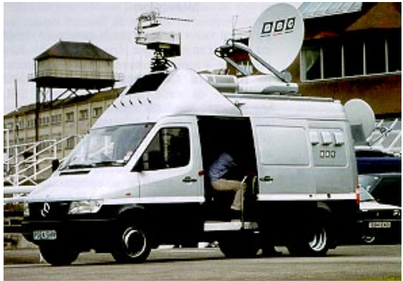
Figure 1 BBC bi-media vehicle on location at the Newbury racecourse.