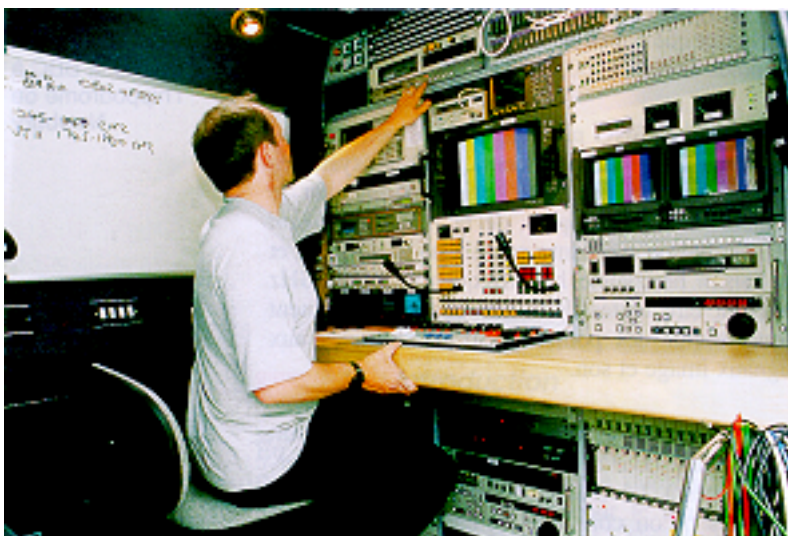
Figure 3 (lower) The Author sitting inside the radio area of the new BBC bi-media vehicle.