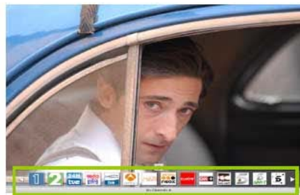
Selector de canal