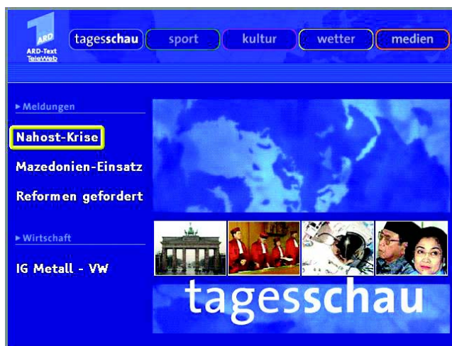
Figure 2 Typical TeleWeb page from the ARD-Text service