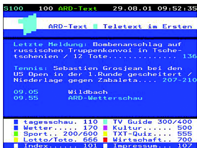
Figure 1 Typical teletext page from the ARD-Text service

The 1997 Internationale Funkausstellung (IFA 97) saw the market launch of the first sets compatible with this display level. It was soon clear that there was little to be gained from modernizing teletext by raising the level. Despite the improvement brought about by the introduction of teletext level 2.5 – with 32 colours and improved graphics – the big gamble did not come off because it had to make allowance for the old level-1 text decoders still in use. Even the possibility of transmitting simple pictures as bit samples (DRCSs – Dynamically Redefinable Character Sets) was not up to expectation. This is because the level 2.5 graphics are only two-colour and are confined to too small a surface. The production of level 2.5 graphics with complex software tools, taking level 1 into account, also complicated the lives of teletext editors and, hence, adversely affected the changeover to level 2.5. What was more, the advertising industry found the "added value" of this improved teletext level was negligible, and this was why that industry, too, showed little interest in an increased use of level 2.5.