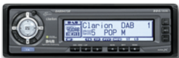
An in-car DAB unit from Clarion.