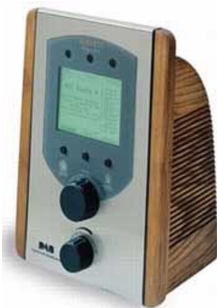
A stand-alone DAB receiver from Roberts.

T-DAB receivers can be implemented with digital signal processing (DSP) integrated circuits and can be integrated with mobile phones and personal digital assistants. The EtherAction Terminal version 1.0 represents