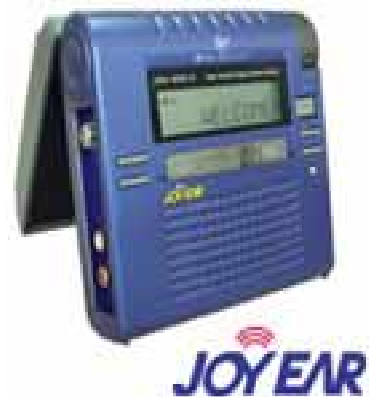
A WorldSpace receiver from JoyEar.

WorldSpace receivers are currently being produced by five manufacturers: Hitachi, JoyEar, JVC, Matsushita (Panasonic) and Sanyo. A dealer in the UK reported that the take-up of commercial receivers is satisfactory. The cost is £99. Throughout Europe, approximately 8,000 receivers, mainly from Hitachi, have been sold. (It should be noted that receivers currently offered by these companies are being advertised on the WorldSpace website for $160 - 210.) WorldSpace anticipated "having approximately 125,000 receivers in the African, Middle East and Asian markets by the close of the year 2000". It is not known whether this expectation was realized. More recently, WorldSpace issued a press release saying that about 150,000 receivers had been sold in Nigeria for a retail price of about $60.