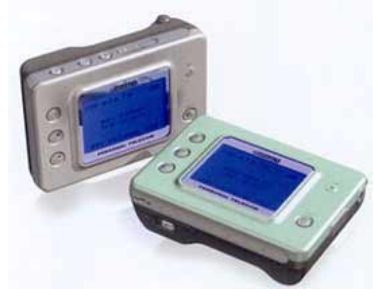
Portable T-DAB receivers from PersTel.

At the recent COMDEX show in Las Vegas, South Korean company PersTel showed a prototype of a tiny portable T-DAB radio (DR-201) based on the Texas Instruments TMS-320C5000 digital signal processor chip. The device offers MP3 recording as well as voice recording and FM tuning.