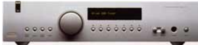
A Hi-Fi DAB tuner from Arcam.