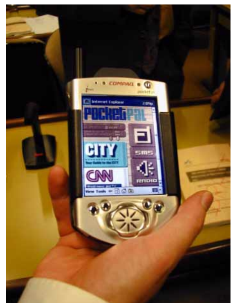
A DAB PDA from EtherAction, based on a Compaq iPaq.