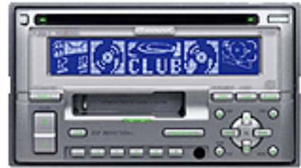
An XM car radio from Pioneer.

Global Radio would probably make use of the existing T-DAB receiver base (with suitable extensions for satellite reception 10 ). By the time of a possible implementation of this service, it is presumed that terrestrial receivers that could be reused for satellite DSB reception will already be widely spread across the market.