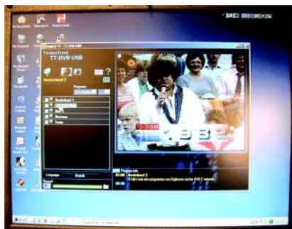
TechnoTrend DVB-T PC adapter