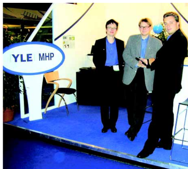
The YLE team

Several of YLE's MHP applications have been translated into English for wider testing in Europe, and some of these were on show at the EBU Village. Whilst the Pacman® game was definitely for old time's sake, and testified to the