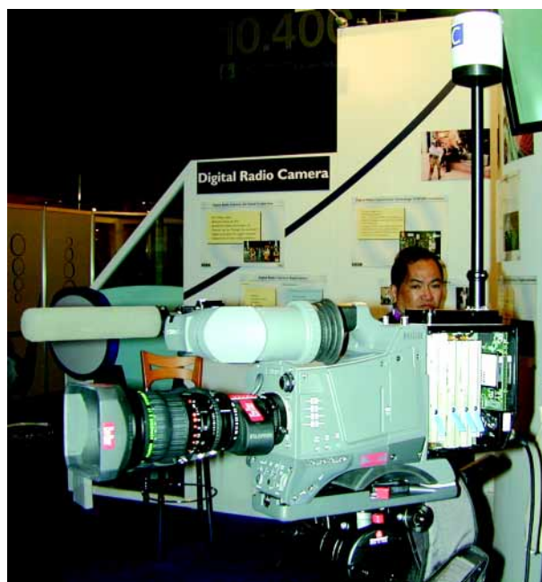
Partially-undressed COFDM camera

This year's model was, as its name suggests, based around DV compression, rather than last year's MPEG model. The COFDM circuitry had been further integrated and made lighter (but I promise you that carrying it around on the same shoulder non-stop for 40 minutes does make you aware that there must be more scope for weight saving – helium-filled lens packages for instance).