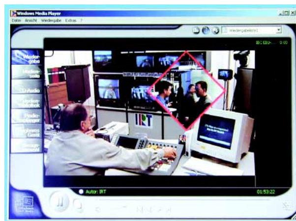
IP multimedia streaming on a PC

Both IRT stands were linked by fibre to Munich to demonstrate different qualities of real-time video transmission, including uncompressed SDI (270 Mbit/s) MPEG-2 DVB/ASI over IP and high quality PC-based video streaming. TV cameras on both IRT stands sent pictures to Munich where a third TV camera showed the local equipment there, and a mixed signal was sent back to Amsterdam. The net result of this was that, if you stood in front of the stand camera and waved, you could watch yourself waving back – delayed by the latency inherent in the digital coding system being used on the video signal. On the SDI feed, this was negligible but on the PC streaming demo, you had time to wave, walk the two metres or so to the PC screen and take a couple of sips of whatever was in your glass before witnessing the (inevitably unedifying) sight of yourself making a spectacle of yourself.