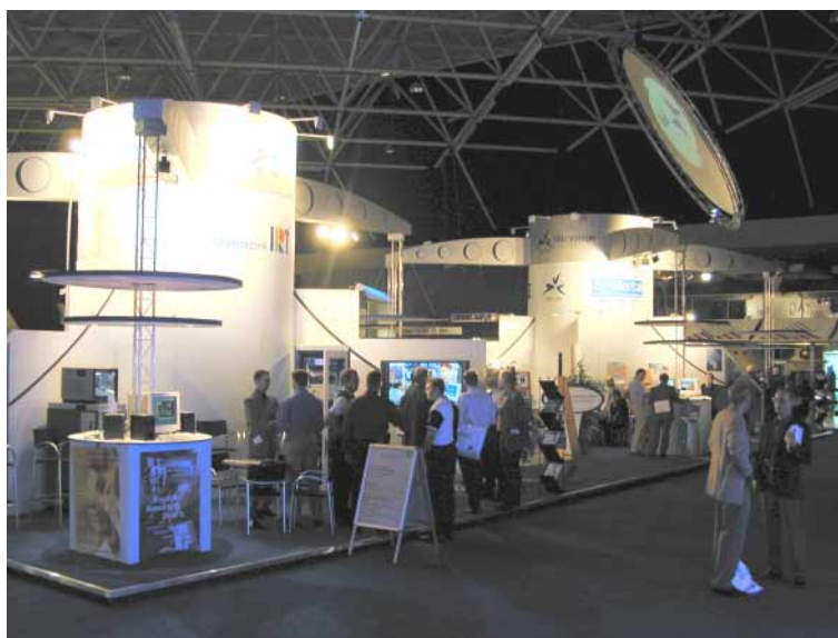
... and the reality