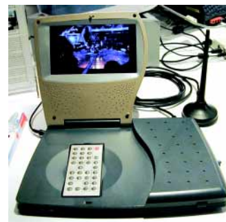
HiTop DVB-T portable TV