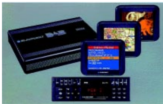
A selection of early DAB receivers from Bosch.

The current situation – including why the Eureka-147 DAB system is not being used for WorldSpace – can be understood by drawing some historical threads. All radio broadcasters need to follow this development.